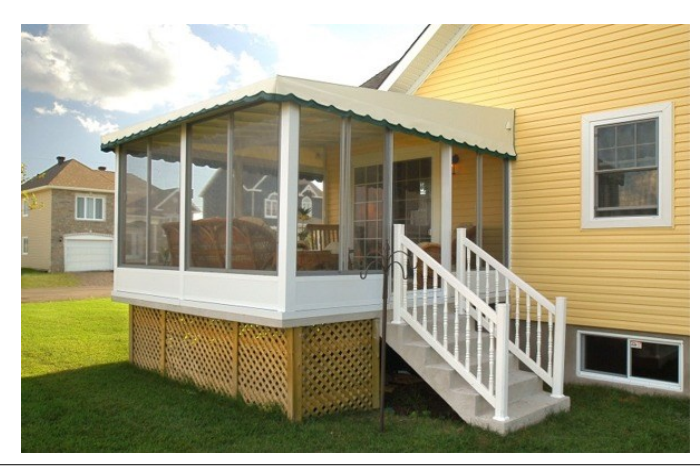
All Prices in US$ — FREE Delivery in continental USA No hidden costs — No handling fees — No silly fees

For Information or to order CALL (800) 922-4760