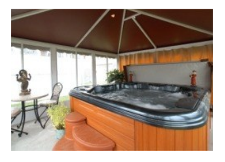
An excellent hot tub enclosure!