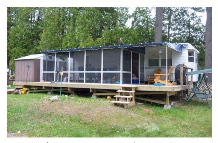
You can design your screen room to be any combination of enclosed screen room with open canopy (on right or left hand side). Please call us for pricing on the one you would like to build!